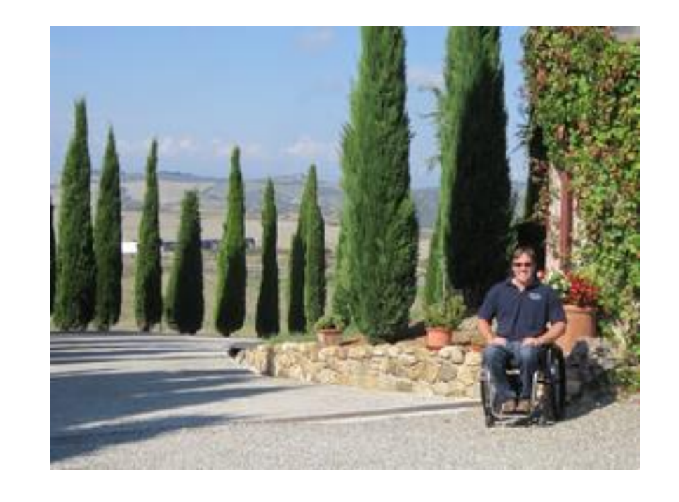
View Rating Explanation