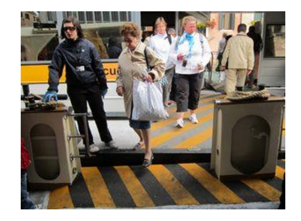
View Rating Explanation