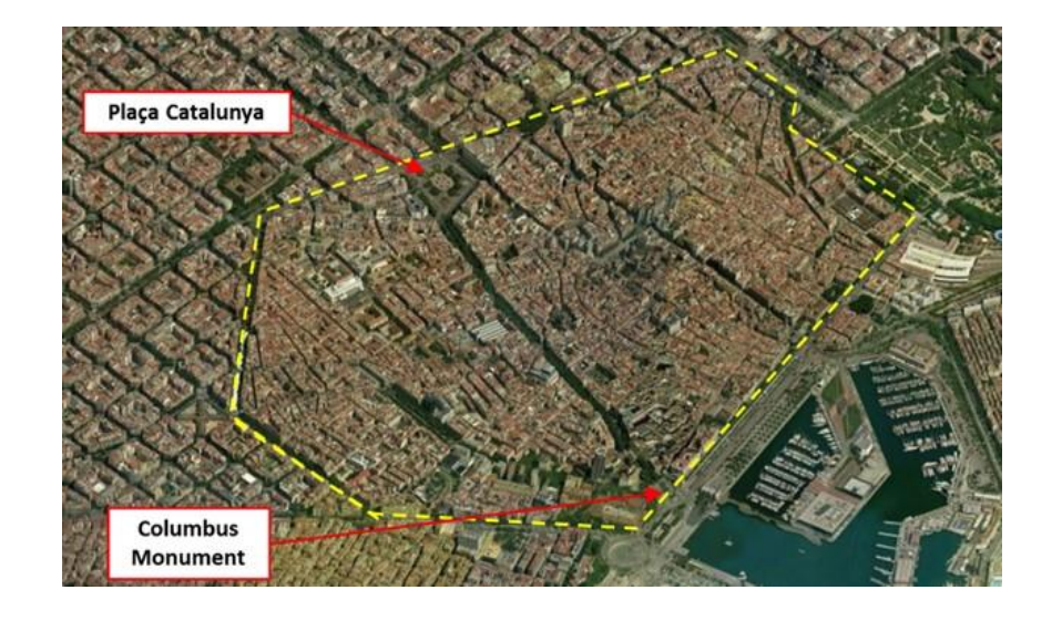
View Rating Explanation