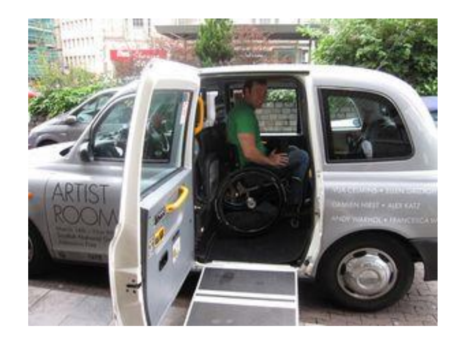
View Rating Explanation